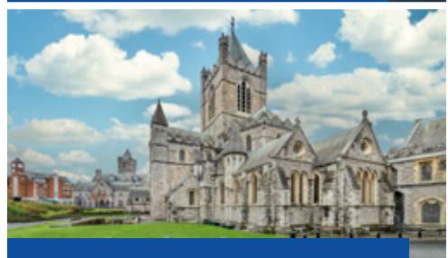
christ Church Cathedral, Dublin 8